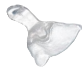
Individual impression tray