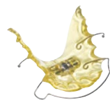
Orthodontic retainer and expansion plate