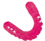
Splints for diagnostics