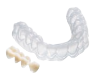
Moulds for temporaries